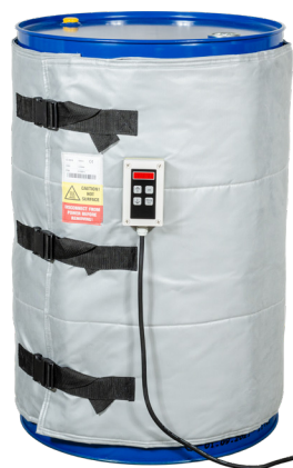
110V 1200W: 11-9870A 230V 1200W: 11-9870