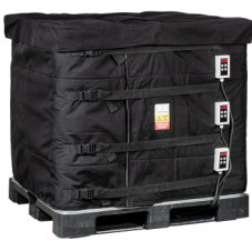
3 Zone (0-90°C) 3x1000W 230V: 11-9861B