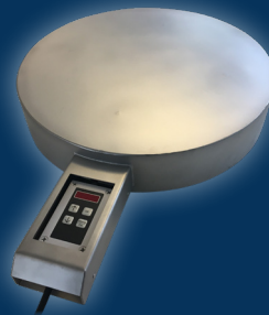
Base Drum Heater (0-120°C)