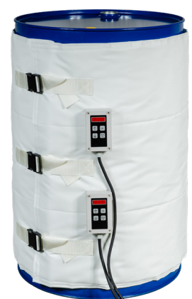
1 zone - 230V 1200W: 19-2746 2 zones - 230V 2x600W: 12-1208DT