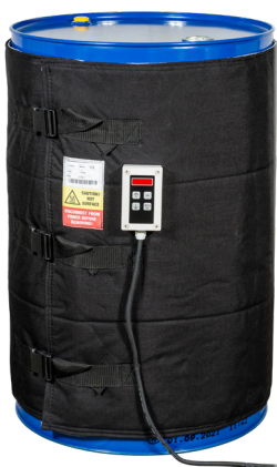
110V 1200W: 11-9858A 230V 1200W: 11-9858