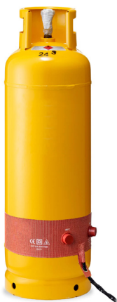
230V 500W: 23-4407

Choosing our gas cylinder heaters safeguards your operations against the adverse effects of frosting, investing in reliability and uninterrupted productivity.