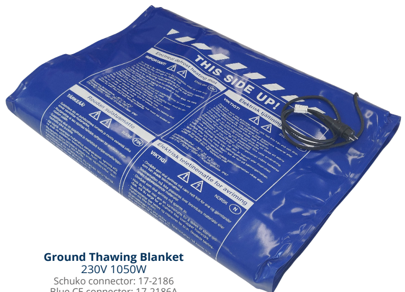
Ground Thawing Blanket 230V 1050W

Schuko connector: 17-2186 Blue CE connector: 17-2186A