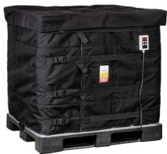
1 Zone (0-40°C) 1300W 230V: 11-9860A