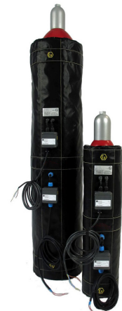
10L - 230V 380W: 23-4266 50L - 230V 850W: 23-4265 79L - 230V 850W: 23-4264