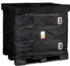
2 Zone (0-90°C) 2x1000W 230V: 11-9860