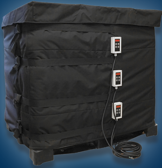
IBC Container Heating Performance Contents: Water

Results may vary depending on the IBC content, the environment, wind and other factors.