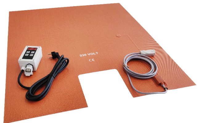
IBC Base Heater (incl. digital controller for 0-150°C) 2700W 230V: 13-1436S