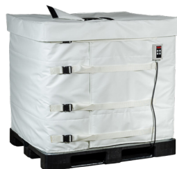
1 Zone 0-40°C 1300W 230V: 20-2798