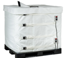
2 Zone 0-90°C 2x1000W 230V: 20-2797